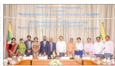
The commemorative group photo session in progress during the MoU signing ceremony between Myanmar and India yesterday in Nay Pyi Taw.

In the ceremony, the "Memorandum of Understanding for 'Dryer and Dryer's House for Agriculture Development and Farmer Welfare'", the "Memorandum of Understanding for the Implementation of AICARE knowledge repository", the "Memorandum of Understanding for the Implementation of AICARE knowledge repository", the "Memorandum of Understanding for 'Wearing and Vocational Sector Development Project under Saundar Weaving and Educational Institute in Amarapura, Mandalay Region'", the "Memorandum of Understanding for