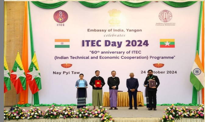
Signing Ceremony of Five Quick Impact Projects during ITEC day celebration

The signing ceremony for five GOI-assisted Quick Impact Projects (QIP), was held on 24 October 2024 in Nay Pyi Taw. The Projects will augment public infrastructure in the field of Artificial Intelligence (AI), e-learning, law enforcement and rural development for the benefit of the people in states and regions across Myanmar.