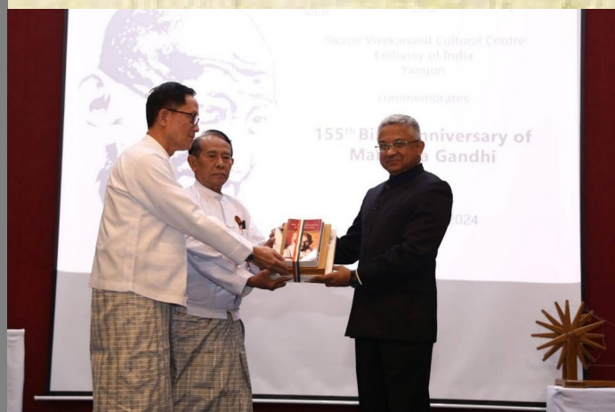
Burmese translation of works of Mahatma Gandhi was handed over to the representatives of Shedagon Pagoda

A Briefing session was held in Embassy of India, Yangon on 02 September 2024 for Myanmar candidates (2 for PG and 03 for PhD) at Assam Agricultural University, for various tea related courses.