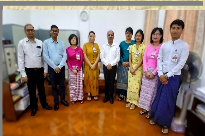
Briefing Session at EoI, Yangon with ITEC participants

A Briefing session was held on 23 September 2024 for participants of Specialized training course on “Master of Arts Degree in Social Work” for two years at Tata Institute of Social Science, Mumbai.