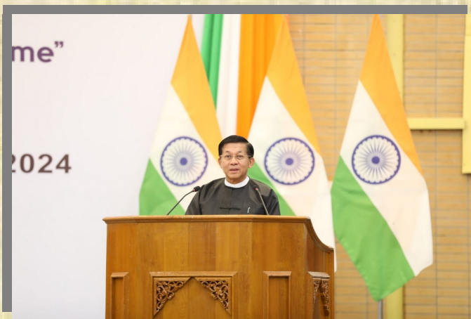
Prime Minister Min Aung Hlaing addresses the gathering on ITEC Day

Embassy of India, Yangon celebrated 60 th anniversary of the Indian Technical and Economic Cooperation (ITEC) Programme- ITEC Day-2024 at Myanmar International Convention Centre-II, Nay Pyi Taw on 24 October 2024. The Chairman of State Administrative Council Prime Minister Senior General Min Aung Hlaing along with his spouse, graced the event as the Chief Guest. With participation of more than 400 people. The event was attended by Union Ministers, Senior functionaries of the Government of Myanmar, ITEC alumni, Indian community members and officials from the Embassy.