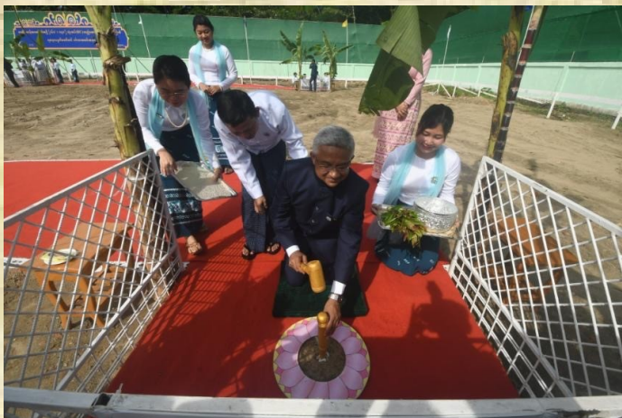
Ground Breaking Ceremony for the Construction of the Sarsobeikman building

The Ground Breaking Ceremony for the Construction of the three-storey Sarsobeikman building, USD 3.77 million GoI-assisted project for construction of a literary Centre, was held on 9th October 2024 at the project site in Yangon. The Ground Breaking Ceremony was led by Senior General Prime Minister Min Aung Hlaing, Union Minister of Information U Maung Maung Ohn, Ambassador of India to Myanmar Sh. Abhay Thakur, and six other dignitaries from Myanmar. The ceremony was also attended by senior cabinet Ministers including Minister of Home Affairs, Minister of Defence, Minister of Investment and Foreign Economic Relations, Senior Tatmadaw officials and literary scholars from Myanmar.