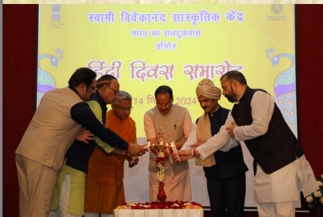
Lightning of Lamp ceremony on Hindi Diwas

Swami Vivekananda Cultural Center, Embassy of India, Yangon had organized a grand Hindi Diwas celebration on September 14, 2024, followed by a 'Kavya Sammelan', where renowned poets from India recited thought-provoking verses and receives an active participation from local community, students and teachers.