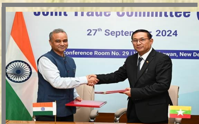
During JTC meeting

A 08-member delegation led by H.E. U Myint Thura, Director General, Department of Trade, Ministry of Commerce, Government of Myanmar visited New Delhi, India on 25 th -29 th September, 2024 for holding the 8 th Joint Trade Committee (JTC) Meeting and 2 nd Joint Monitoring Committee (JMC) meeting.