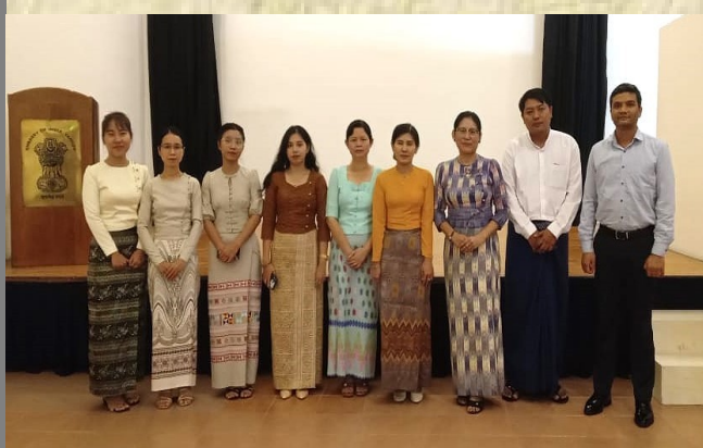
Interaction Session at EoI, Yangon with ITEC participants

Embassy Of India, Yangon organized an interaction programme on 11 October 2024 for participants of ITEC training course on “1 st Mid-Career Training Programme for Civil Servants of BIMSTEC Countries” commencing from 14.10.2024 to 25.10.2024 at National Center for Good Governance, Mussoorie.