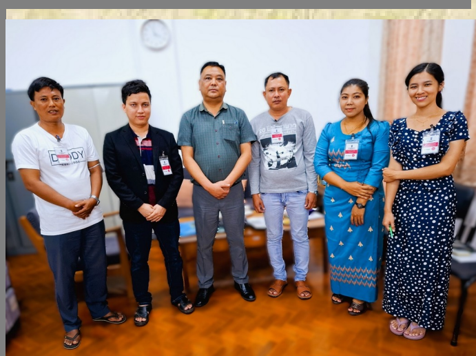
Interaction Session at EoI, Yangon with ITEC participants

A Briefing session was held in Embassy of India, Yangon on 02 September 2024 for Myanmar candidates (2 for PG and 03 for PhD) at Assam Agricultural University, for various tea related courses.