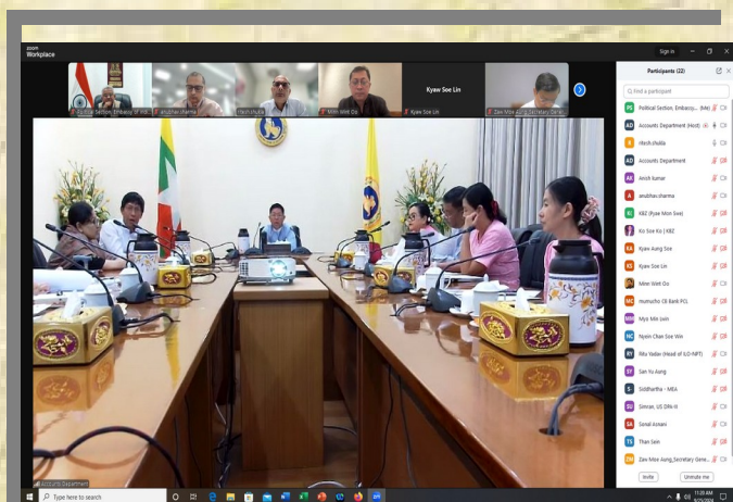
Virtual conference between NPCI, CBM & MPU