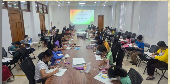
Drawing competition held during Bharat Week celebration at SVCC, Yangon

vibrant hub for promoting cultural exchanges and nurturing appreciation for Indian art and heritage.