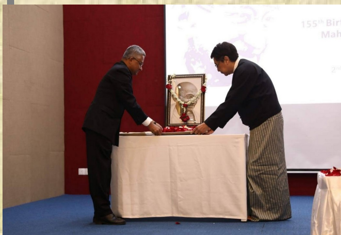
Floral tribute to the Father of the Nation