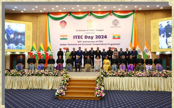
Group photo during ITEC day