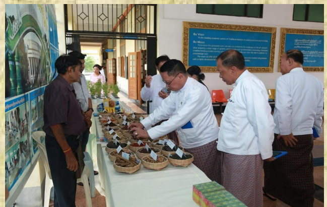
Exhibition on Ayurvedic product

Embassy of India celebrated Ayurveda Day 2024 at UTM, Mandalay