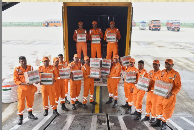
Relief materials are being brought to the airport