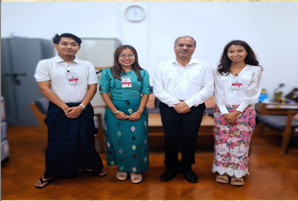
Feedback Session at EoI, Yangon with ITEC participants