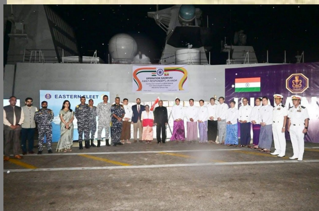
Handing over of relief materials

EOI, Yangon celebrated 9 th Ayurveda Day on 29 October 2024 at The University of Traditional Medicine, Mandalay, in collaboration with University of Traditional Medicine, Mandalay. Over 250 participants, including students, medical professionals, and enthusiasts attended the celebration. The event featured an exhibition showcasing over 100 Ayurvedic products, workshops on traditional therapies, and interactive session led by experts. This initiative highlighted India's rich heritage in traditional medicine and fostered a deeper understanding of Ayurveda's relevance in contemporary healthcare practice in Myanmar.