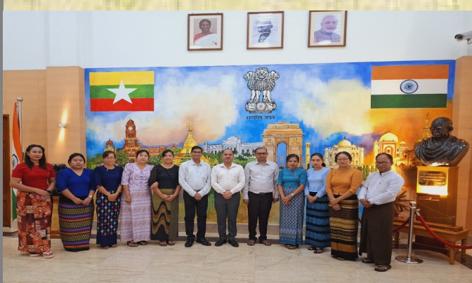
Interaction Session at EoI, Yangon with ITEC participants

Interaction sessions were held for participants from Ministry of Religious Affairs and Culture, Hluttaws, Office of the Auditor General of the Union and Constitutional Tribunal.