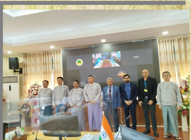
First JWC meeting for construction/up-gradation of Kalewa-Yargyi Road